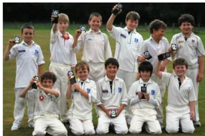
Longparish U11 XI – runners-up for the Oliver Plate

A festival atmosphere and a substantial crowd greeted Fair Oak U11 who batted first and despite some tight bowling and tenacious fielding by Longparish U11 scored 125 for 5 from 20 overs. The Longparish reply struggled against a talented Fair Oak attack, losing wickets in their efforts to maintain the required run rate and Longparish finished runners up to a Fair Oak side riding high in the top division; a superb performance by Longparish U11 of which everyone at the club is immensely proud.